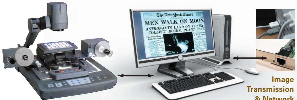
ST200 RFA Digital Film Viewer & PC at Host Library

Mount the roll of film on the ST200 Remote Film Access System at the Host Library and authorize remote access.