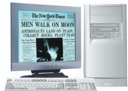
Remote Film Access User